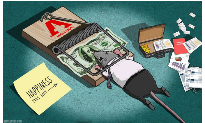
These are the other art pieces for 'The brutal truth about today's world';